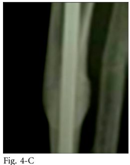
Figs. 4-A, 4-B, and 4-C Serial radiographs of a right tibial nonunion in a thirty-eight-year-old woman. Fig. 4-A Before shock-wave treatment. Fig. 4-B Three months after treatment. Fig. 4-C Six months after treatment, the fracture had healed and the patient had no pain and a fully functional lower limb.